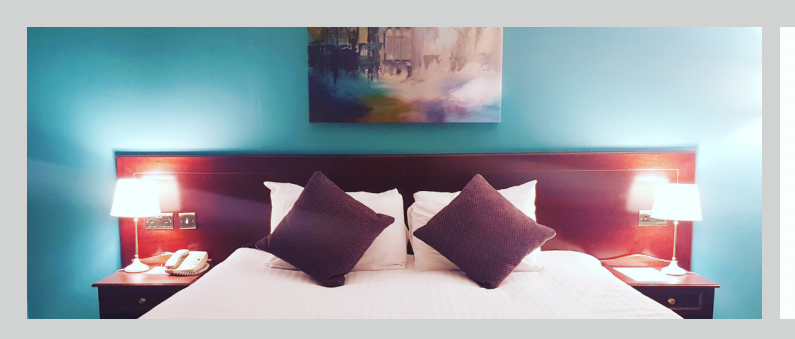
PARTY NIGHT ACCOMMODATION